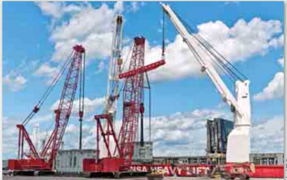
The HHL Mississippi , here unloading transformers at Duluth's Clure Public Marine Terminal in July, was built in 2009 and made her first trip to the Twin Ports in May of this year to load grain.

two of them are owned by Fracht USA, project logistics providers, handling the turnkey logistics for the entire transmission line project. Those two KRL16800 series cars, the latest generation in rail engineering, are being coupled with CP locomotives and flatcars to move the large converter transformers safely to their final destination.