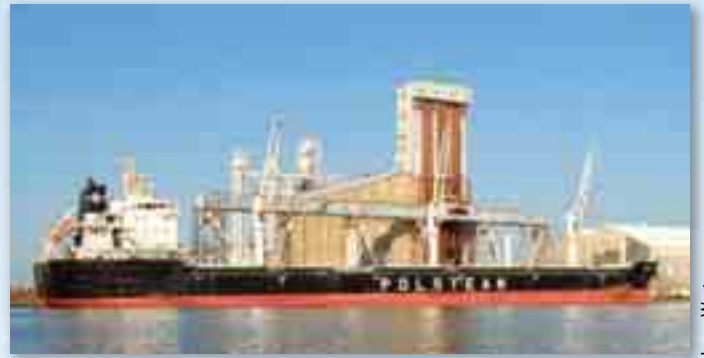
Polsteam's Resko takes on grain at Gavilon on Sept. 10.