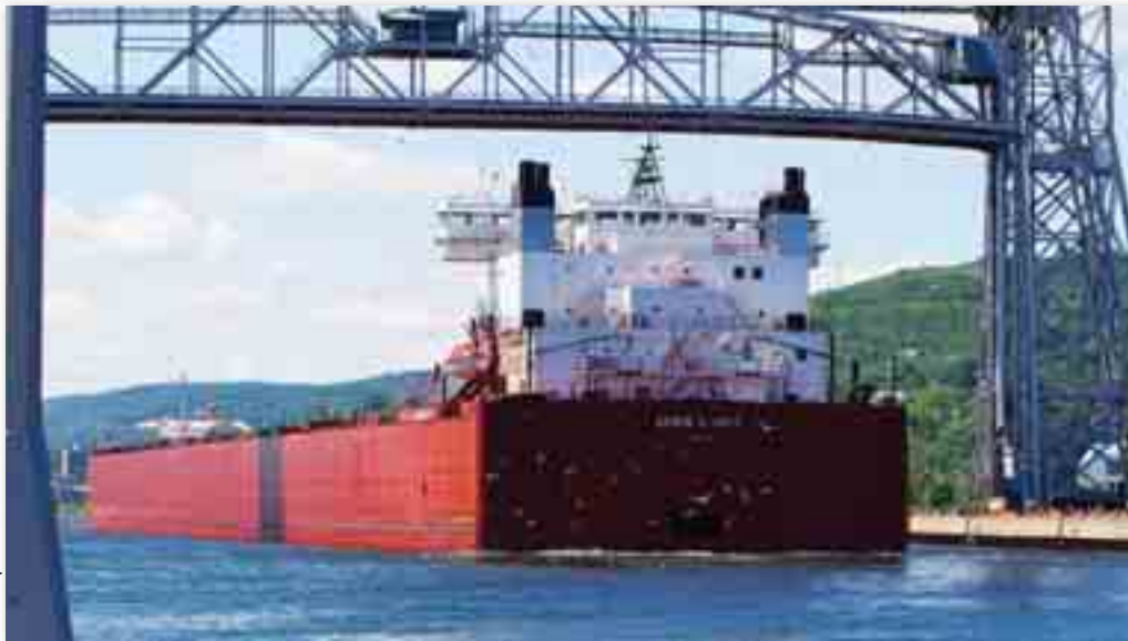
The Edwin H. Gott enters Port on July 18 with a raucous gull escort.