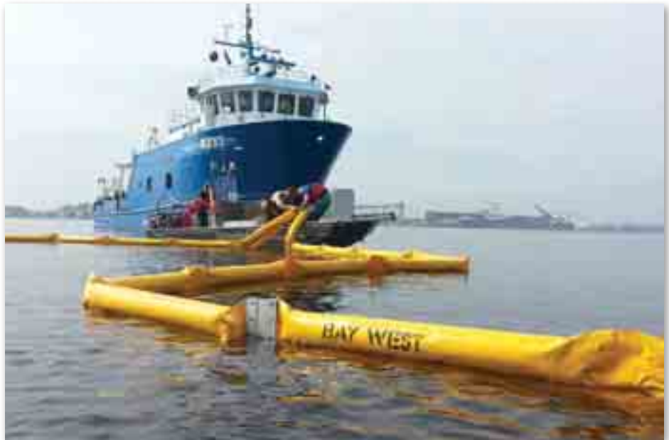
Pollution-containment equipment is placed around the Kiyi during a Coast Guard training exercise.