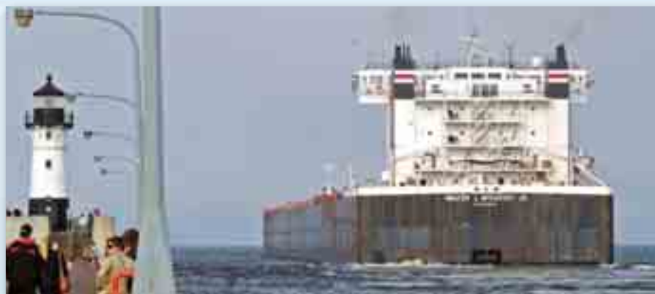
The 1,000-foot Walter J. McCarthy Jr. leaves Port on Aug. 5 after a salute to her namesake.