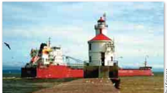
The CSL Baie Comeau , latest in its Trillium class, clears Superior on Sept. 8.