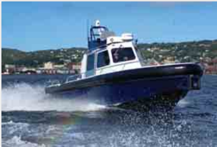
This anti-terrorism boat was built for law enforcement work in the Nashville area of Tennessee.