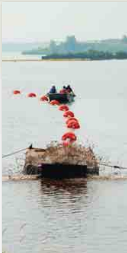
Slurry materials make a splash as they land in the target area of the harbor-restoration pilot project.

In August, natural resource officials announced $16 million in new grants to design the road map to restore natural ecosystems in and around the river — from areas near Fond du Lac to the shoreline of Lake Superior, a 20-mile section hit hardest by human activity and industrial development over the past 100-plus years. The U.S. Environmental Protection Agency and Minnesota Clean Water Fund committed a combined $3.3 million in June toward the planning stages of the restoration effort. New funding announced in August included additional money from the fed-