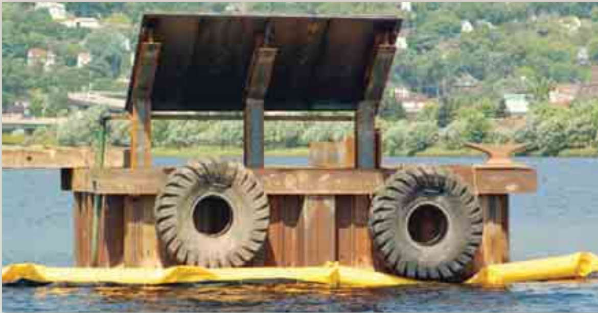
Here's the heftiest mixing bowl in the Twin Ports. (Pilot project researchers call it a materials transfer box.)

addition to habitat restoration,” added Jim Sharrow, Port Authority facilities manager. “That will free up much needed storage space for materials placement at the facility in the future.”