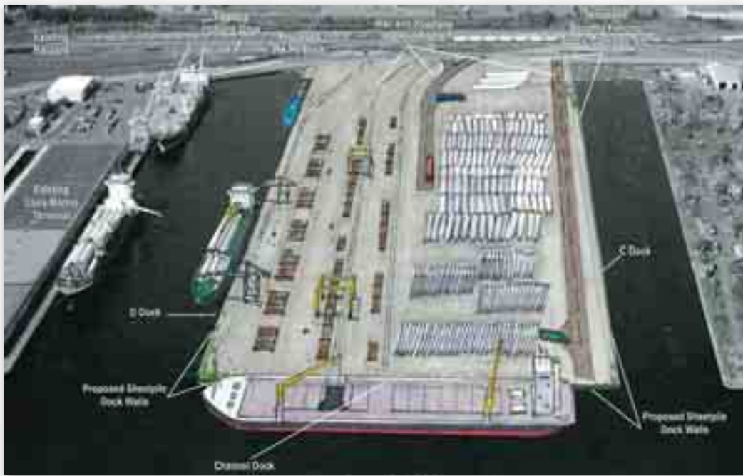
LHB Engineers & Architects