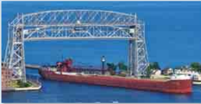
The Hon. James L. Oberstar clears Duluth's Aerial Lift Bridge on Aug. 31.