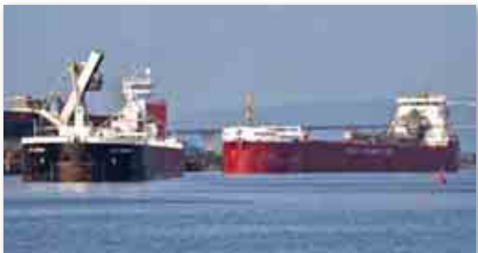
Call it a maritime pas de deux as the tug/barge Lakes Contender/Ken Boothe Sr. and the Whitefish Bay maneuver near the Superior Midwest Energy Terminal.