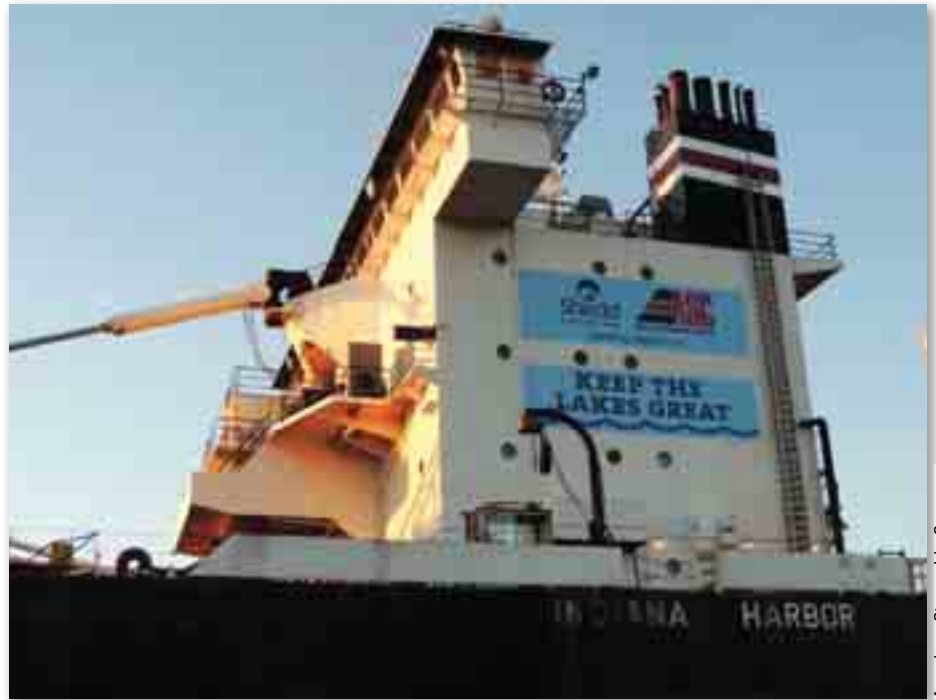
American Steamship Company

The vessel travels throughout the Great Lakes, including ports in western Lake Superior, and southern Lake Michigan, Detroit and Cleveland. ASC is actively researching ways to stop the spread of non-native aquatic species. In an effort to address the issue, ASC has been exploring methods for