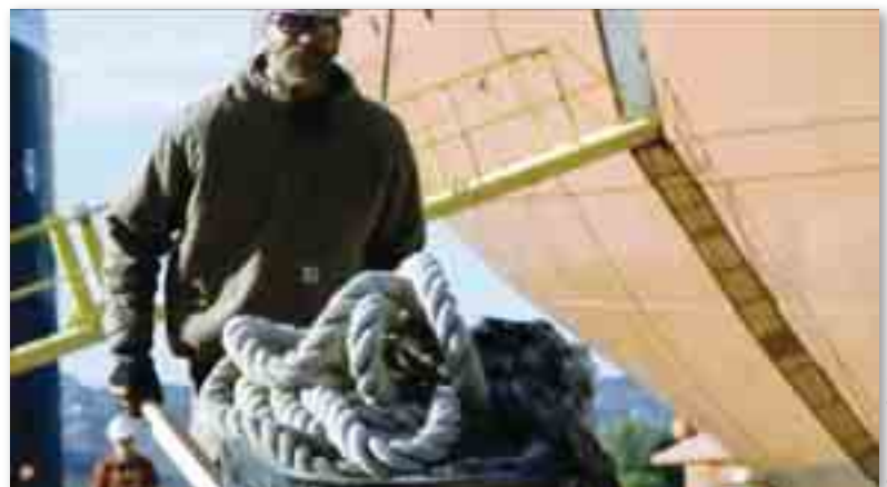
A Carhartt logo discreetly shows behind a load of line as a worker wheels it away during the filming of a commercial at Fraser Shipyards.