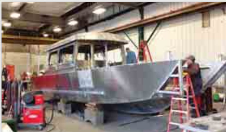
In these two scenes at Lake Assault Boats, a custom hull is being moved (upper photo) onto its blocks where further assembly will continue (lower photo).