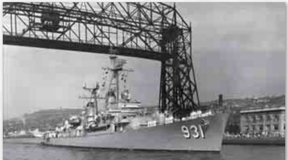
The Forrest Sherman leaves Port on July 15, 1959. Once out on the Lake, the visiting naval fleet performed maneuvers, much to the delight of boatwatchers on shore.

Hauck's ship also played a role, along with Fred Seaton, secretary of the U.S. Department of the Interior, in formally dedicating Duluth's just-completed Clure Public Marine Terminal.