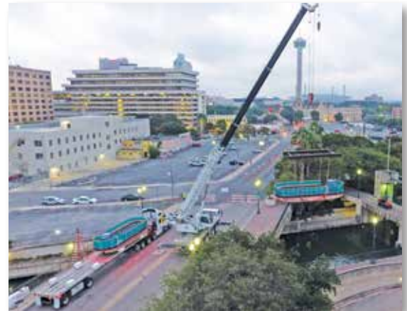
Lake Assault Boats

The remaining 19 barges still under construction in Superior were scheduled to be delivered by the end of November. The $6.2 million project is the largest order to date for Lake Assault Boats, which has built some of the most capable police and fire emergency response watercraft for public safety agencies nationwide. The aluminum boat manufacturing company is part of Fraser Industries.