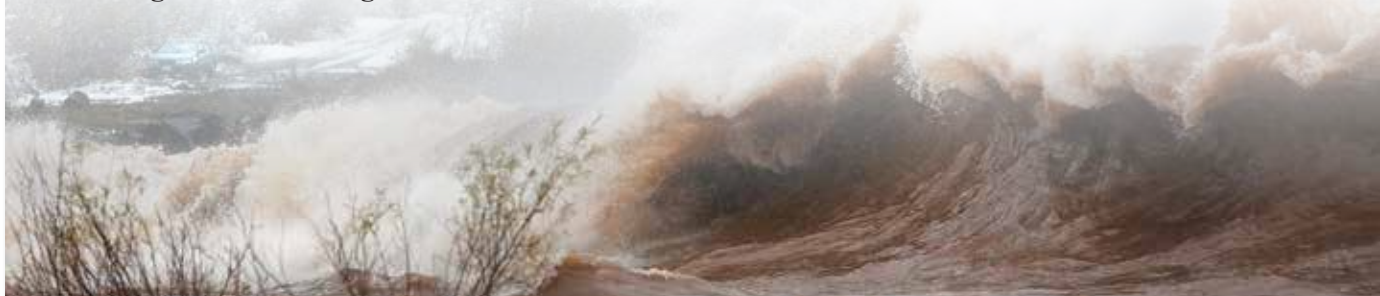
Relentless waves batter the shoreline at Brighton Beach in Duluth.