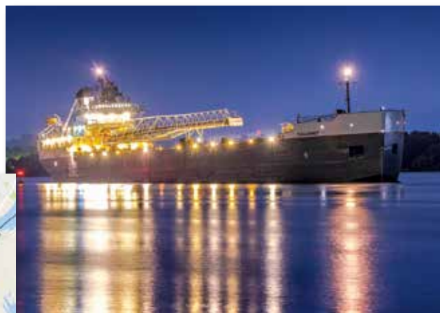
Calumet grounding Aug. 9 as viewed from shore