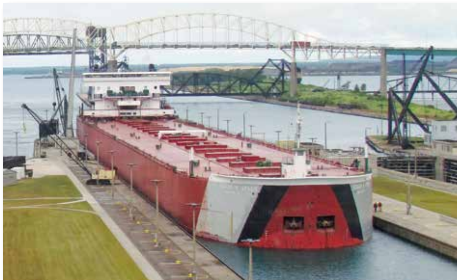
The Edgar B. Speer locking through the Poe Lock downbound at Sault Ste. Marie. (2012 photo)