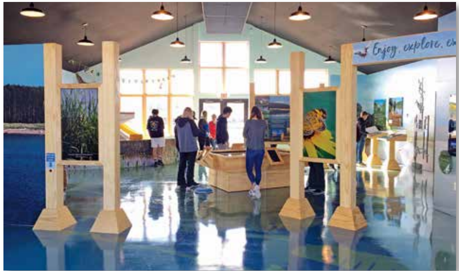
Grand opening of the Lake Superior Estuarium