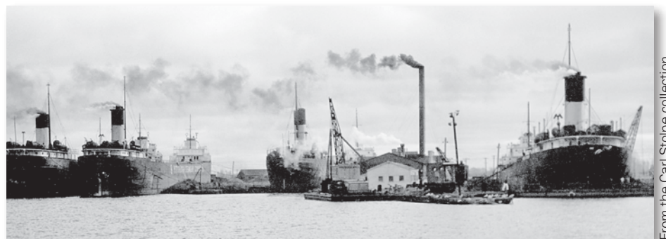
Book cover photo of Fraser Shipyards (circa 1948)

In The Yard can be purchased online at www.inlandmariners.com .