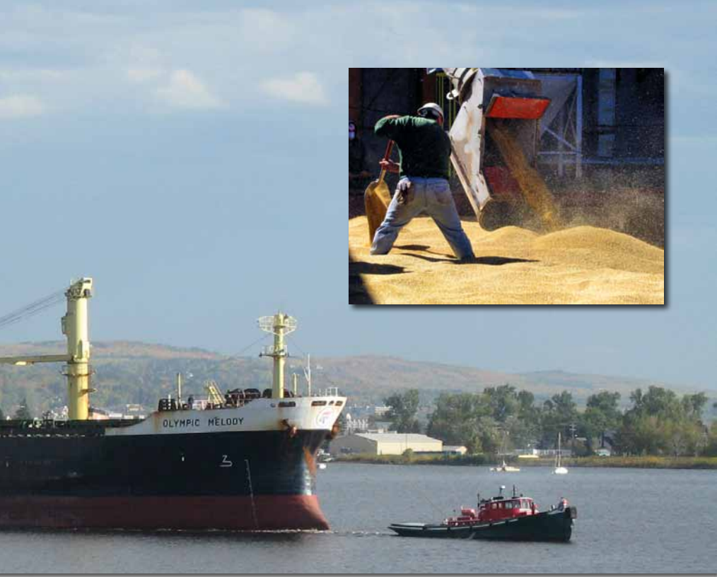
Inset: Loading grain is a job for man and machine.