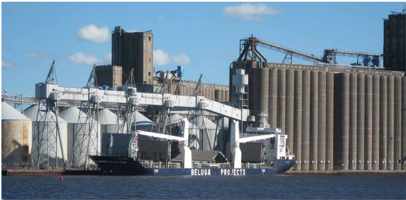
The Beluga Fairy left the CHS elevator on Sept. 13 loaded with nearly 12,000 short tons of durum wheat bound for Algeria.