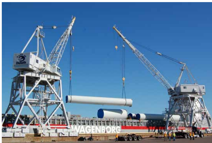
On Sept. 1, 20 tower sections from Spain were discharged from the Dongeborg at the Clure Public Marine Terminal and destined for a wind farm installation in southwestern Minnesota.

Denmark, Germany, Spain and the U.S. destined for a variety of wind energy projects across the U.S.