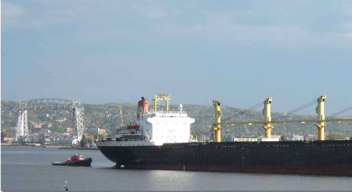
Tugs escort the Olympic Melody into Port on Sept. 29 to load grain at CHS.