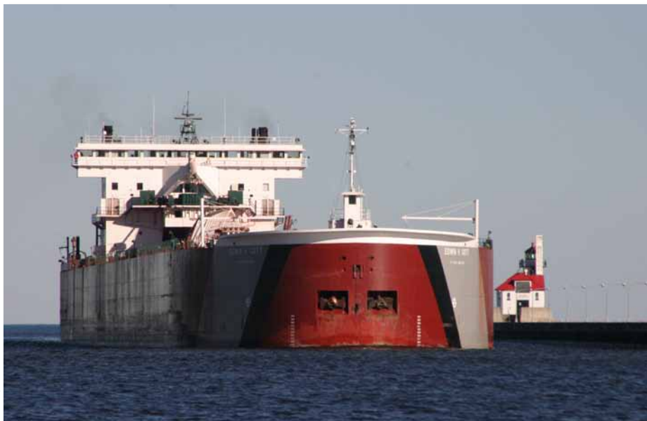
A major improvement is in store for the Edwin H. Gott .