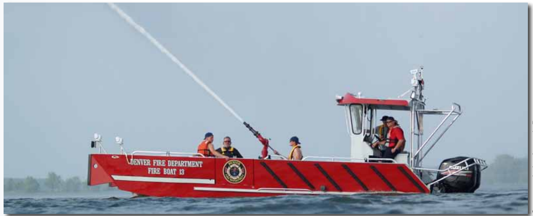
Lake Assault Boats built this 28-footer for the fire department of Denver, N.C.

Bottom line: Fraser will gain about 1,200 linear feet in new or