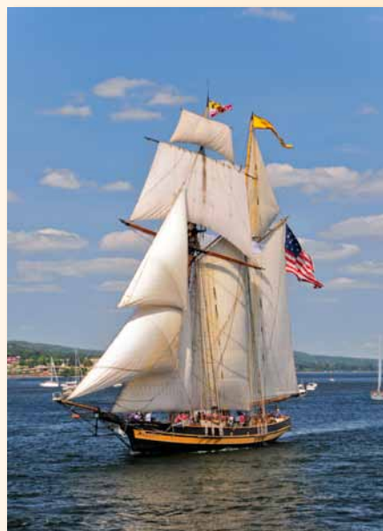
The Pride of Baltimore II was co-sponsored by Ceres and the Duluth Seaway Port Authority for Tall Ships® Duluth 2010.