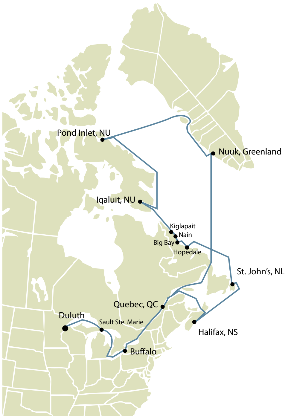
The Alder visited these ports: Buffalo, Halifax, St. John's, Hopedale, Big Bay, Nain, Iqaluit, Pond Inlet, Nuuk, Quebec City and Sault Ste. Marie, Mich., before returning to Duluth.

The Alder is a 225-foot seagoing buoy tender that conducts aids to navigation and ice-breaking missions in Lake Superior. She was launched in February 2004 in Marinette, Wis., and replaced the cutter Sundew in Duluth-Superior in October of that year.