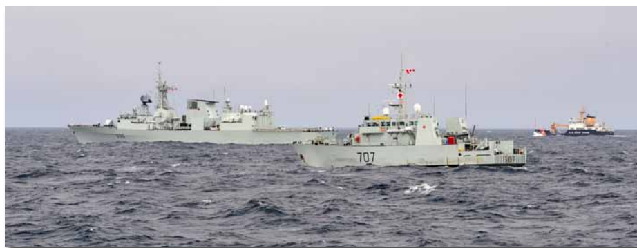
Operation Nanook wasn't always smooth sailing for the Alder and her Canadian and Danish counterparts.