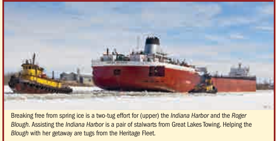
Breaking free from spring ice is a two-tug effort for (upper) the Indiana Harbor and the Roger Blough . Assisting the Indiana Harbor is a pair of stalwarts from Great Lakes Towing. Helping the Blough with her getaway are tugs from the Heritage Fleet.