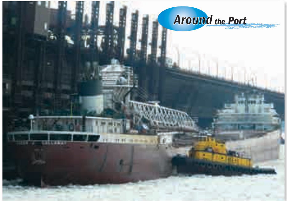
Heritage Marine’s Helen H. nudges the Cason J. Callaway into place at the CN docks early this season.

Duluth TWIC office: Seaway Building 802 Garfield Ave., #101 (218) 727-2367 Tues. & Wed. 10 a.m. – 4 p.m.