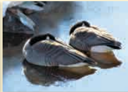
The north country's hardy Canada geese handle lingering winter weather by hot-footing it across the snow, or just sleeping the darn thing off.