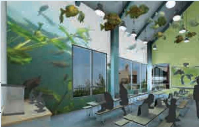
Artist's rendering of Exploratorium classroom.