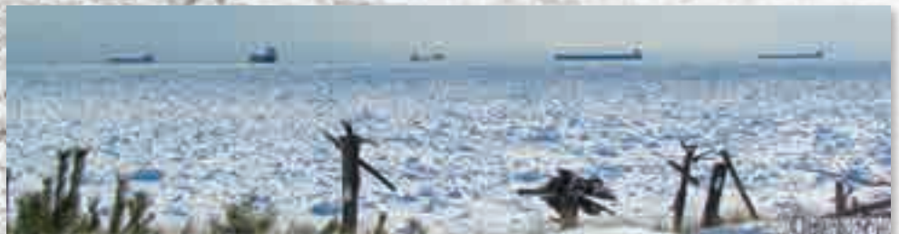
Nine ships (five visible here) rode out stiff winds off the Duluth entry waiting for ice to be cleared.