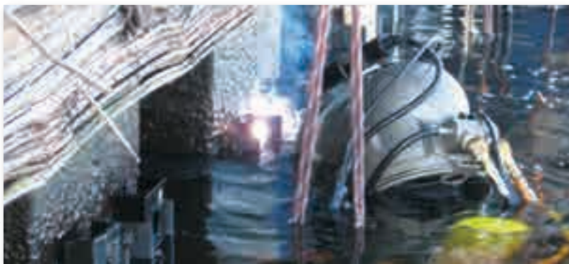
The new company's staff is hard-hat trained and certified.