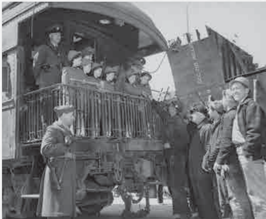
Superior Public Library