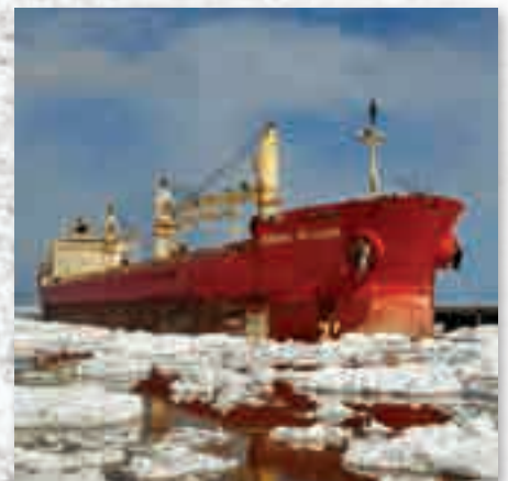
The Federal Welland arrives after spending several days at anchor off the harbor.