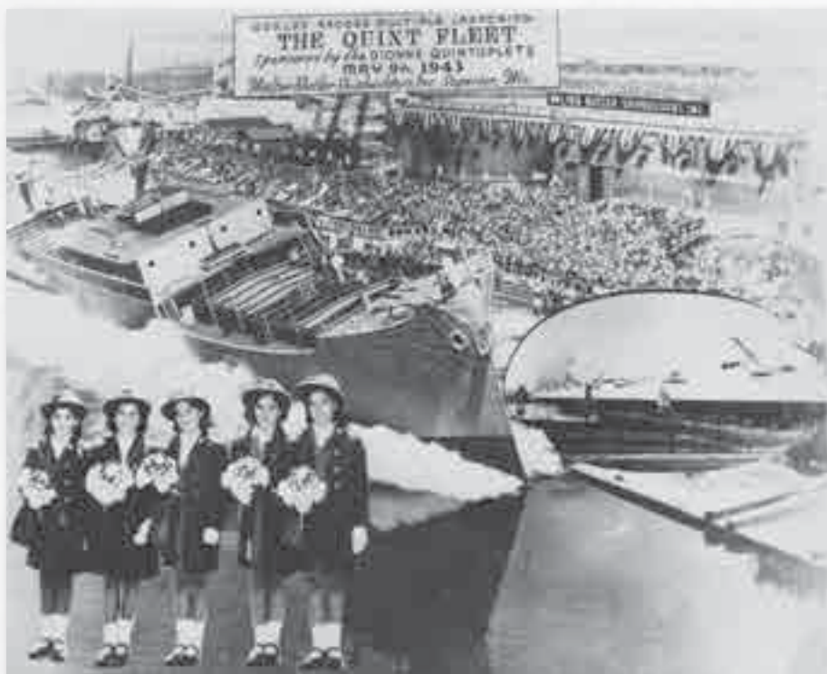
This photo montage was prepared by the Walter Butler Shipbuilders to sum up the day of the five launches.

By mid-1942 Butler was well into the construction of its first ships, vessels that were designated N3-S-1A.