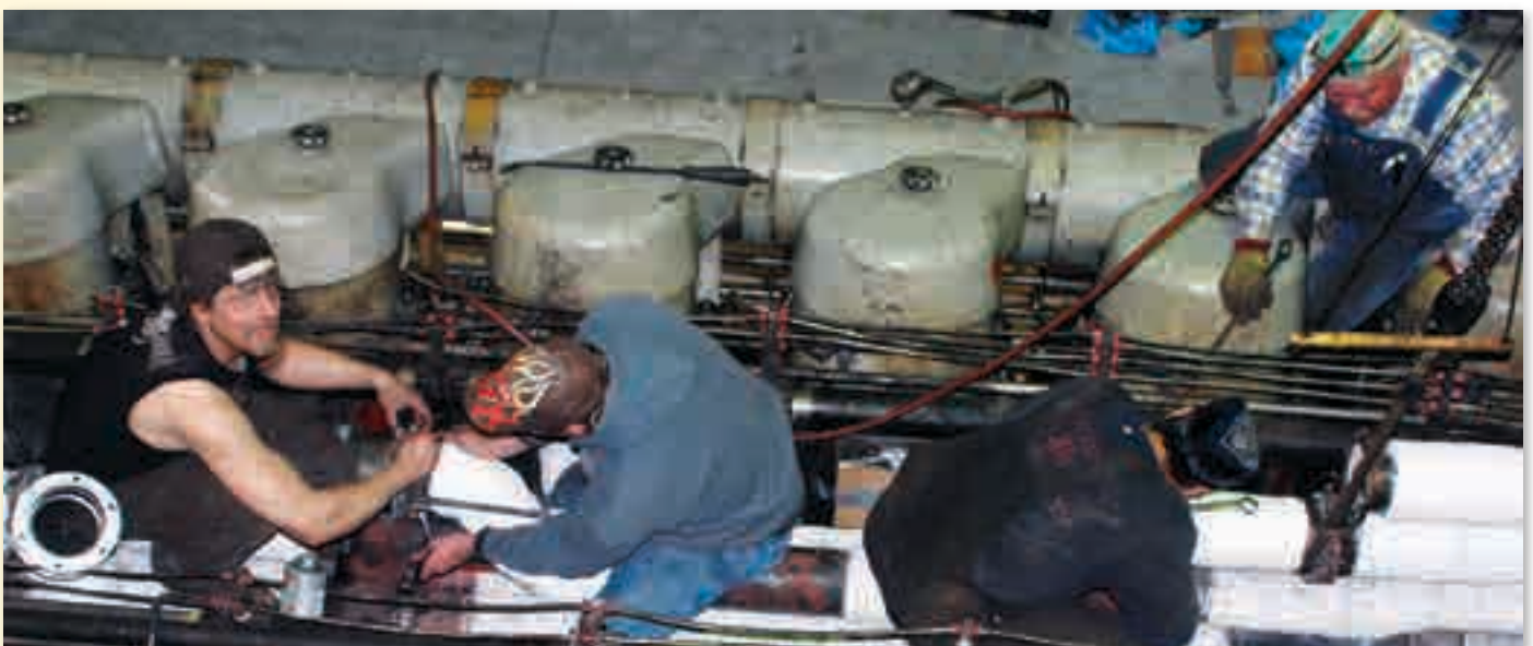
Fraser Shipyards crew reassembles an engine exhaust system after overhauls.