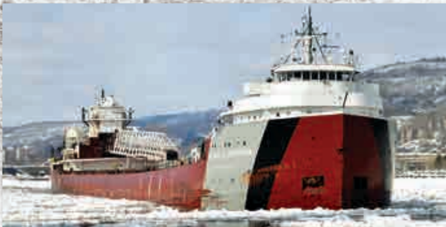
The Arthur M. Anderson plows through ice after being cleared to depart.