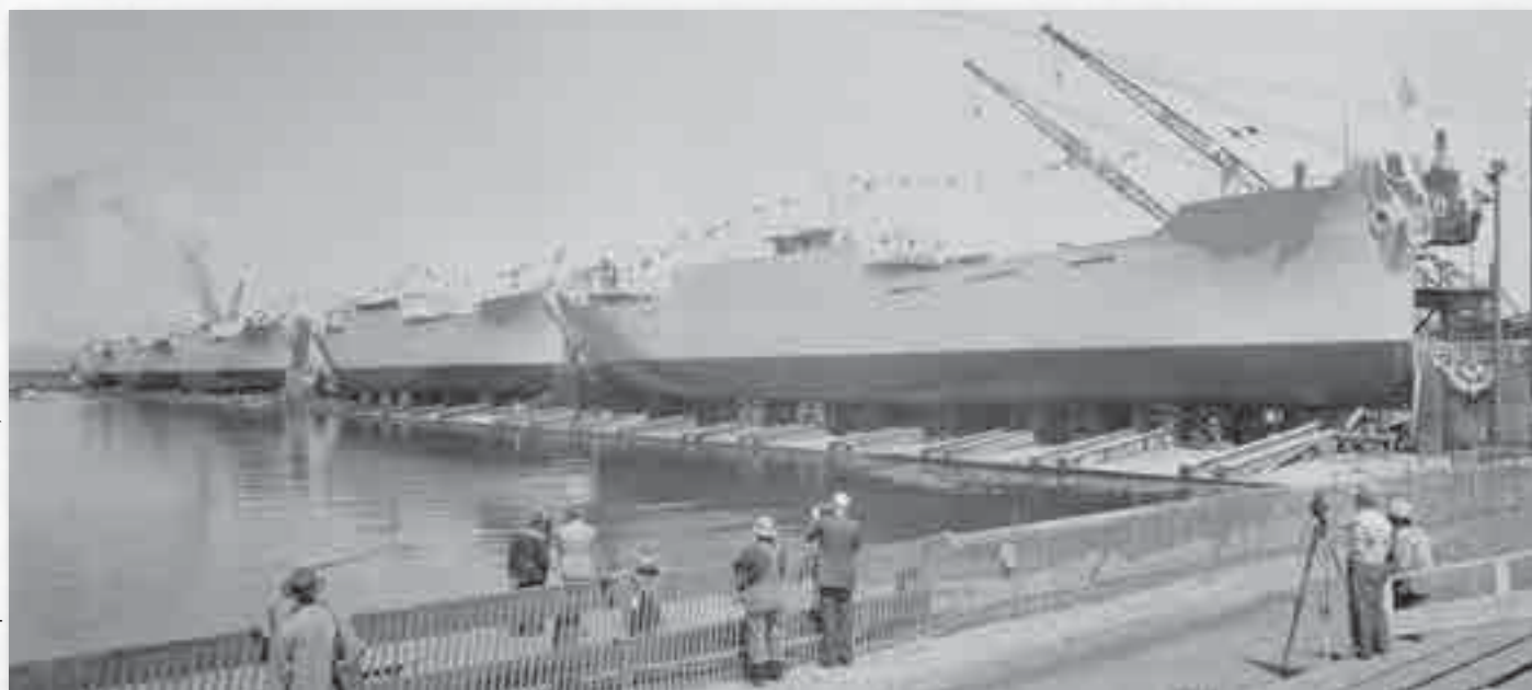
Five N3 cargo vessels, lined up and waiting for the arrival of the world's five most famous little girls. Butler Shipbuilders had readied two launch crews, each with 25 riggers to ride the ships down and 100 sledgemen to knock away the wooden blocks and allow the ships to slide down the ways.

May 9 was cool, and the Quints put on red coats over their gray dresses