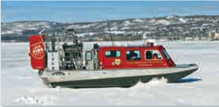
This Lake Assault rescue boat, the Brigade III , can reach 50 mph-plus. It is operated by the Lake Vermilion Fire Brigade in northern Minnesota.